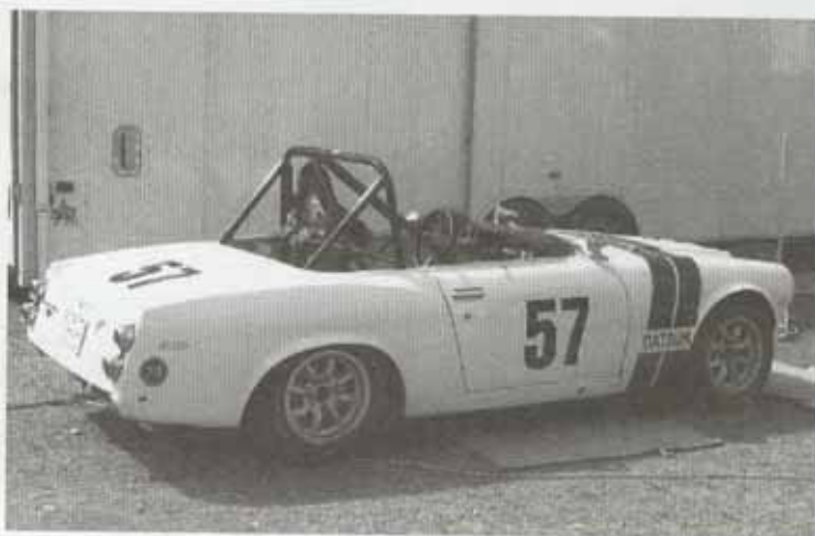
Don Herman's 1969 Datsun SRL-311U from Pepper Pike, OH (Best Lap 2:30.453)