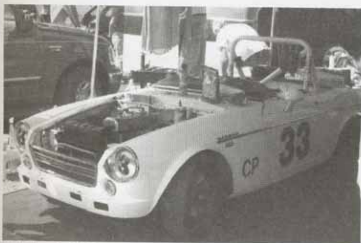
Dick Tillinger's 1967 Datsun SRL-311 from Allegany, NY (Best Lap 2:23.735)