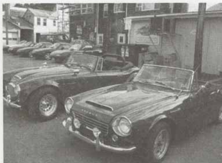
Restored Datsun on display downtown Watkins Glen