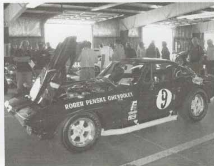
Mark Donohue Original - 1969 Chevrolet Camaro Z/28