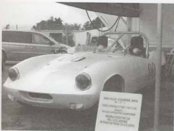
Mark Donohue Original - 1961 Elva Courier MKII