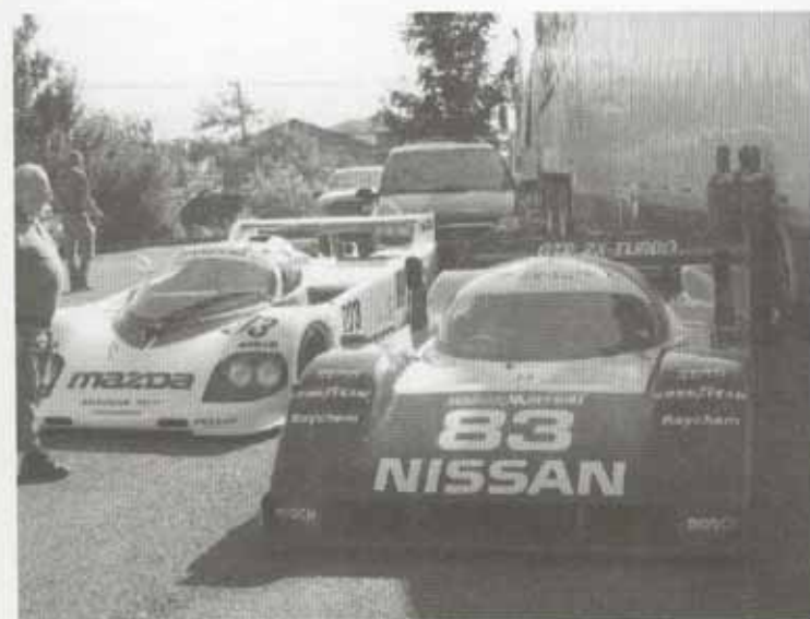
James Oppenheimer's 1990 Nissan R90c GTP from Chicago, IL (Best Lap 1:39.513)