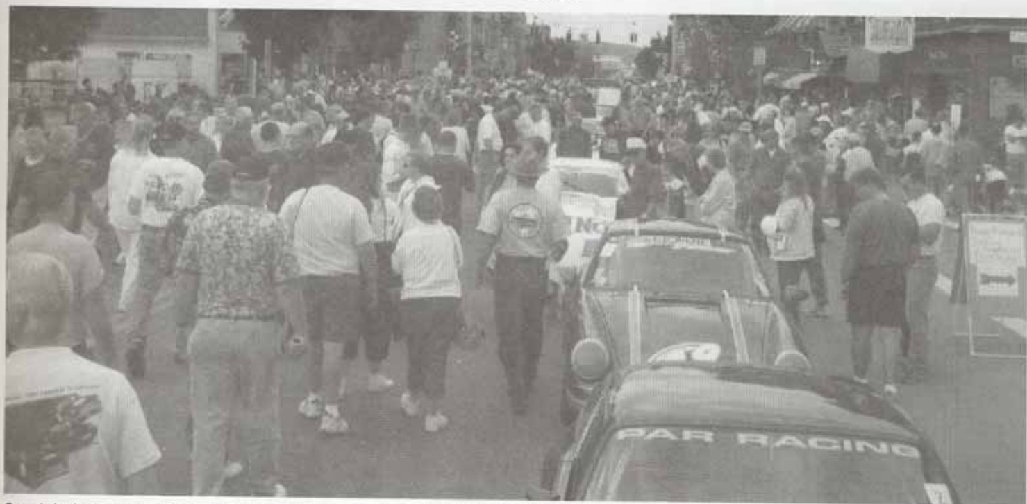
Crowds in downtown Watkins Glen just before the re-enactment of the original racetrack.