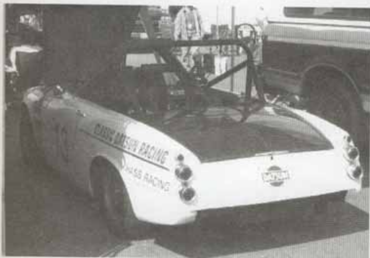
Tom Phelan's 1967 Datsun SRL-311 from Hendersonville, NC (Best Lap 2:36.454)