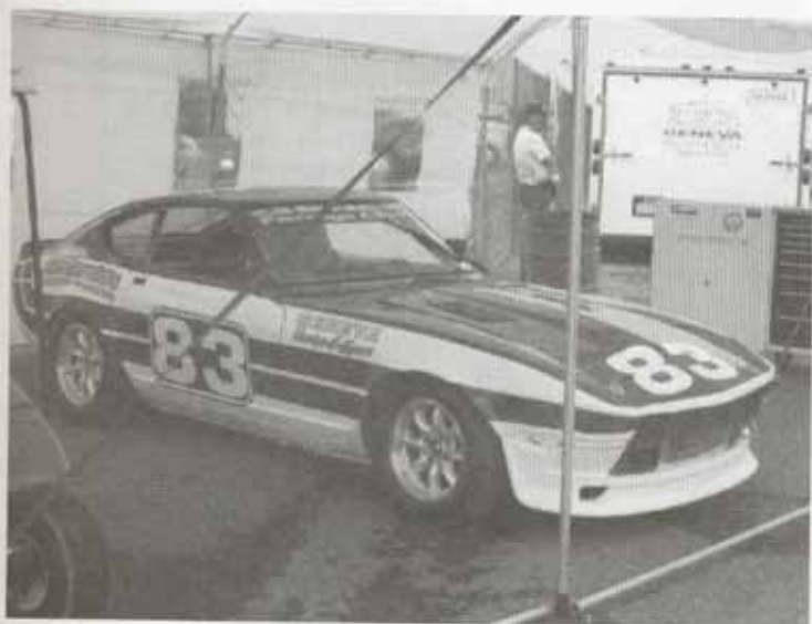
Tom Fitzgerald's 1972 Datsun 260z from Geneva, NY (Best Lap 2:15.236)