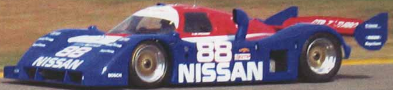
The 1991 Nissan NTP1 car placed 2nd in the HSR Historic GTP Race at the 24 hours of Daytona