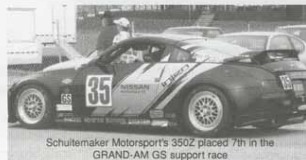
Schuitemaker Motorsport's 350Z placed 7th in the GRAND-AM GS support race

Most important to note is the number of your local Datsun friend's that will be seen racing at Mosport this year. 15 Datsun cars (240Z's, 510s, a B210 and a 1200 Coupe) have all signed up to participate in VARAC's new Group 70+ Class. Events and dates are listed at www.varac.ca/events.html - come out and support the local talent!