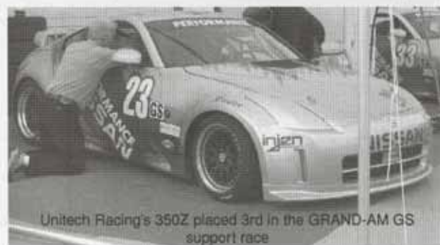
Unitech Racing's 350Z placed 3rd in the GRAND-AM GS support race

Many Nissan 240SXs can be found at CASC-OR's SOLO I (timed lapping) and SOLO II (auto cross) competitions ( www.casc.on.ca/events.php ) and DriftNation's drifting competitions ( www.driftnation.com ). Nissan Sentras (including not-forgotten vehicles from the now-defunct Nissan Sentra Series) and the occasional Datsun (510 or zed car) can be found in the CASC-OR Touring GT Championship and Ontario Challenge Cup ( www.casc.on.ca/events.php ). Newer 350z's can be found at a couple of different events. Road racing at the GRAND-AM series ( www.grandamerican.com - unfortunately Mosport is not on their schedule this year but Mt Tremblant, Watkins Glen and Mid Ohio certainly are)