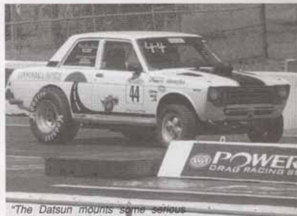
"The Datsun mounts some serious tires and prepares for the 1/4 mile."