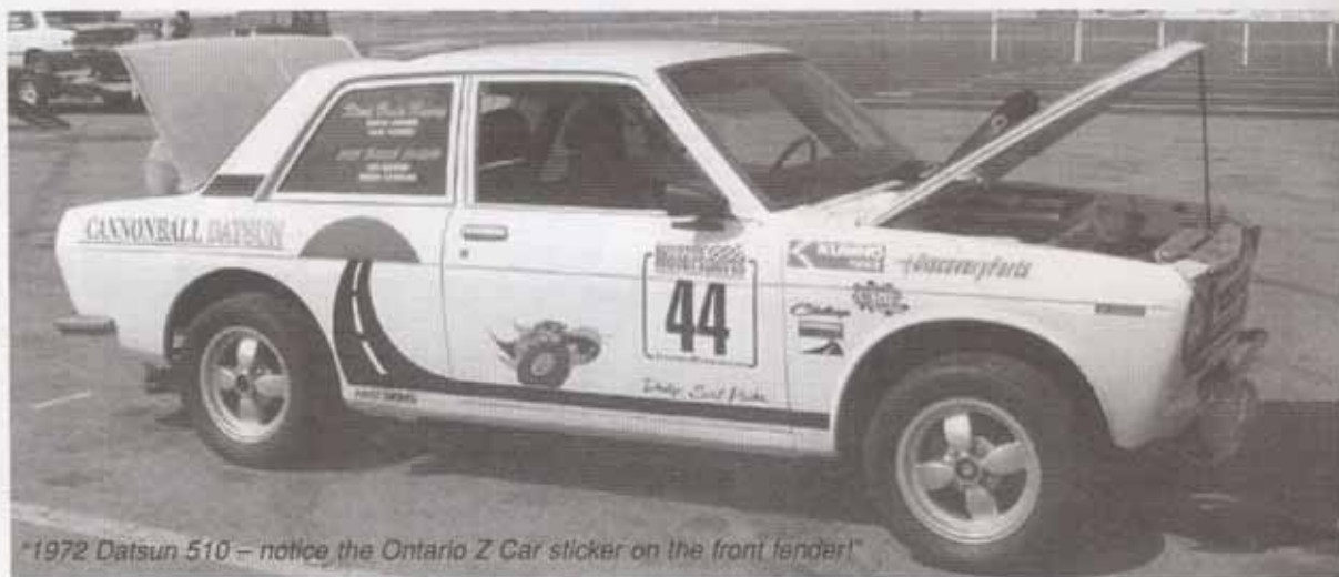
"1972 Datsun 510 – notice the Ontario Z Car sticker on the front fender!"