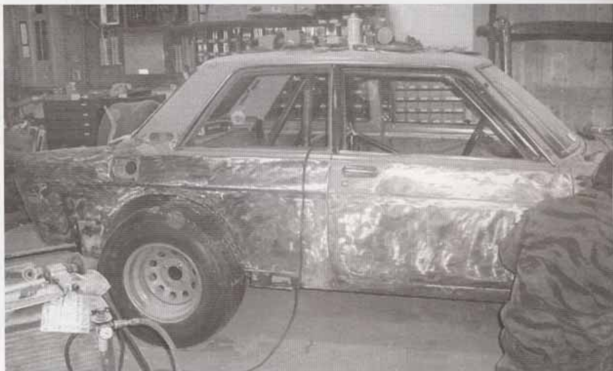
"The Datsun 510 being restored for the Grassroots Motorsports $2005 Challenge"

Sounds easy huh? After watching my car-shop-storage neighbours trying to meet this challenge over the last couple of winters I'm amazed at what it takes to actually