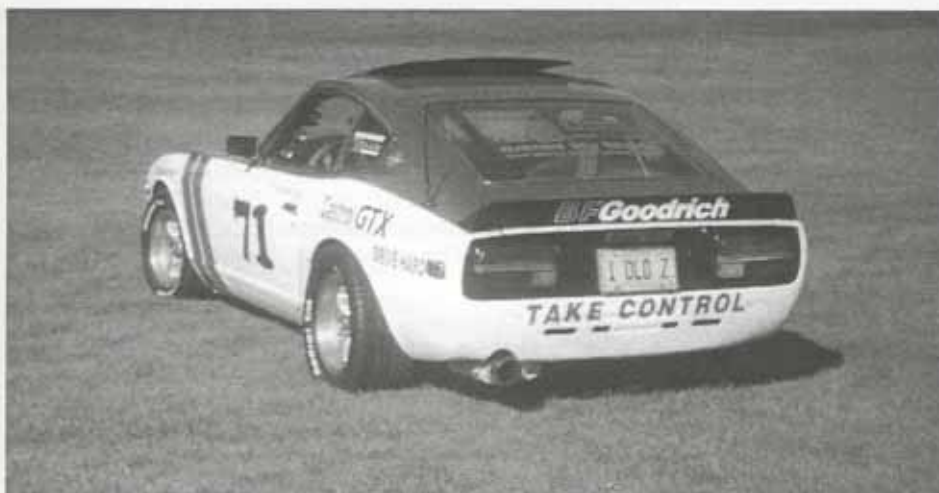
The beautiful BRE styling of the 1971 Datsun 240z

Best of luck Danny – we're looking forward to seeing you and the magical Z back in action!